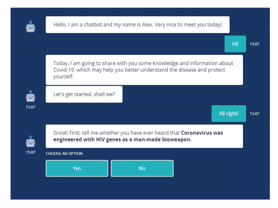
Figure 1. The Chatbot Interface.

The chatbots were built using the Landbot platform (https://landbot.io/) (see, Figure 1 for the chatbot interface). Their links were inserted in the Qualtrics questionnaire. In the chatbot conditions, participants were directed back to Qualtrics at the end of the conversation and were instructed to answer the remaining questions. One attention-check question was added to make sure that participants did not skip the interaction: A picture of an orange was shown to participants at the end of the chatbot conversation. Upon returning to the questionnaire, participants were immediately asked to choose the correct picture of fruit they saw after chatting with the bots. The participation of those who chose the wrong fruit picture were immediately