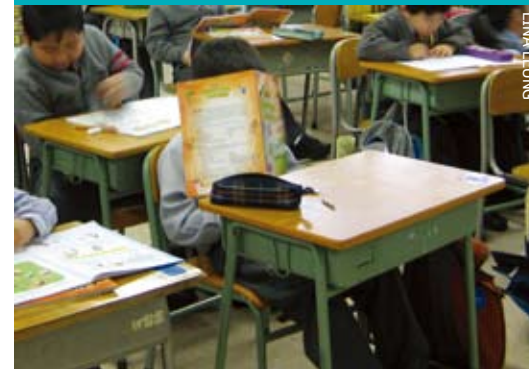
Attention Deficit / Hyperactivity Disorder is one of the eight types of Special Education Needs.