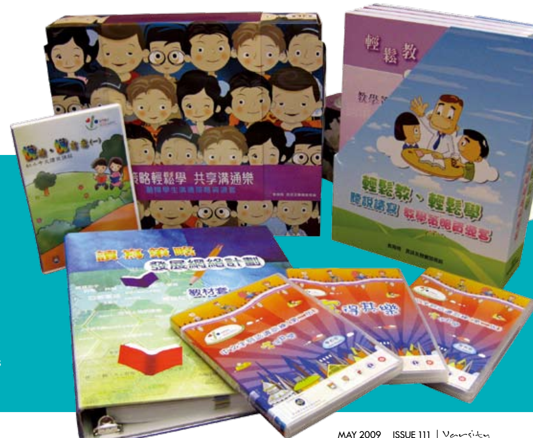
Specifically designed teaching materials facilitate the learning of SEN students.